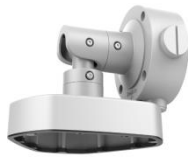
P-283ZJ Wall Mount (3-axis Adjustment)