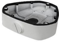
P-281ZJ-DM25 Inclined Ceiling Mount