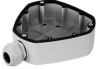
P-280ZJ-DM25 Junction Box