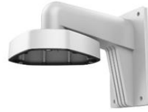
P-273ZJ-DM25 Wall Mount