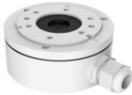
1280ZJ-XS Junction Box